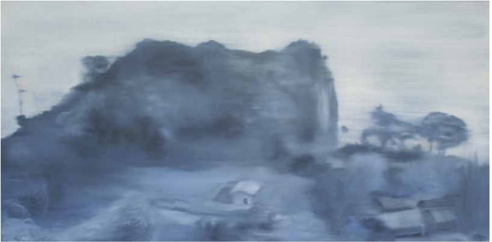
Meo Vac Blue Moutains, 2011 | Oil on canvas | 199 x 98 cm