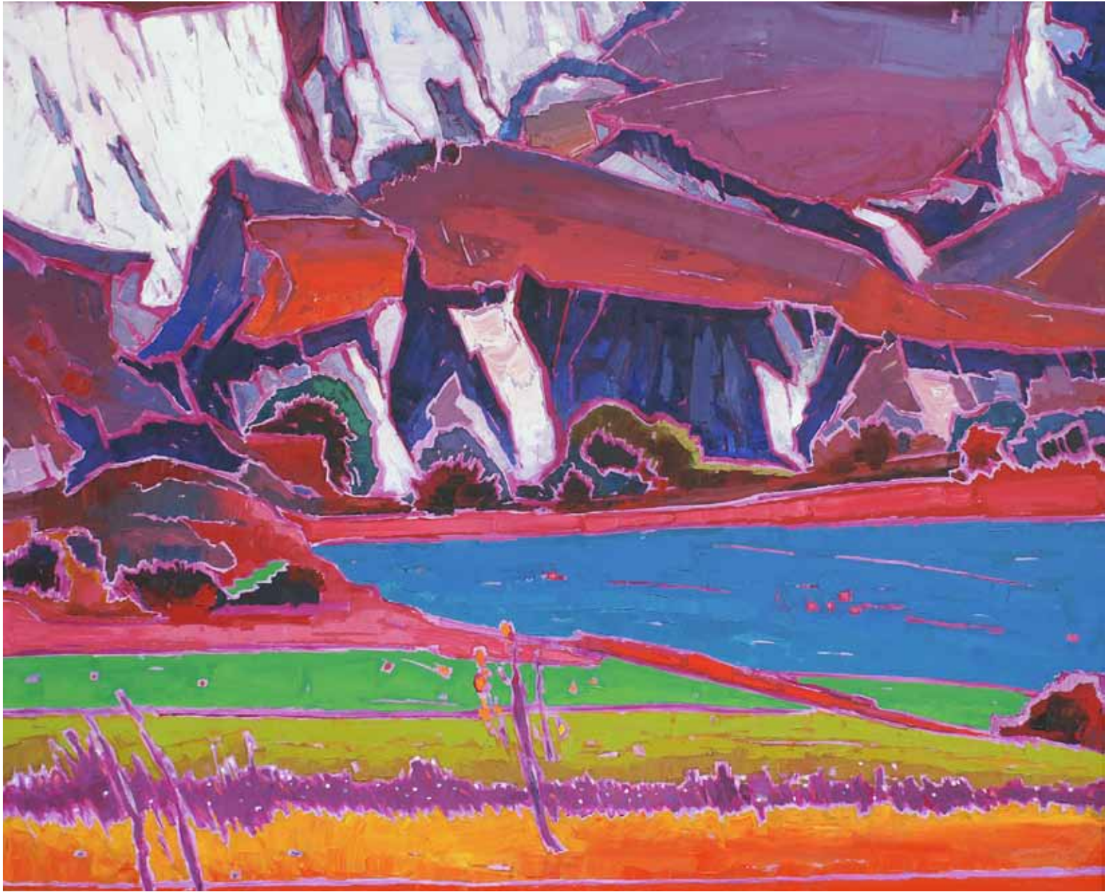
Stark White, 2012 | Oil on canvas | 183 x 122 cm