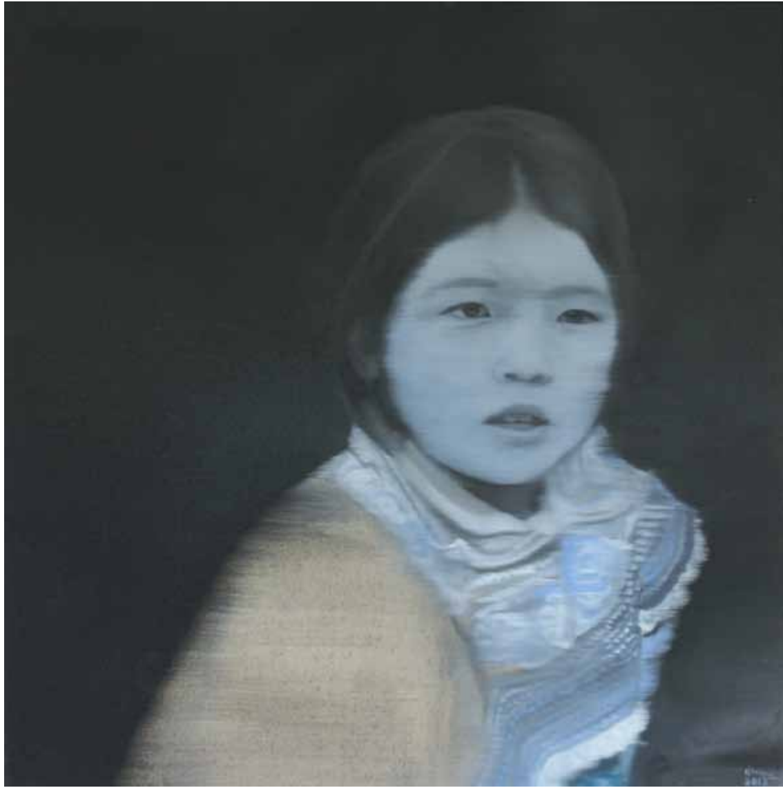
Young Hmong Girl, 2012 | Oil on canvas | 88 x 88 cm