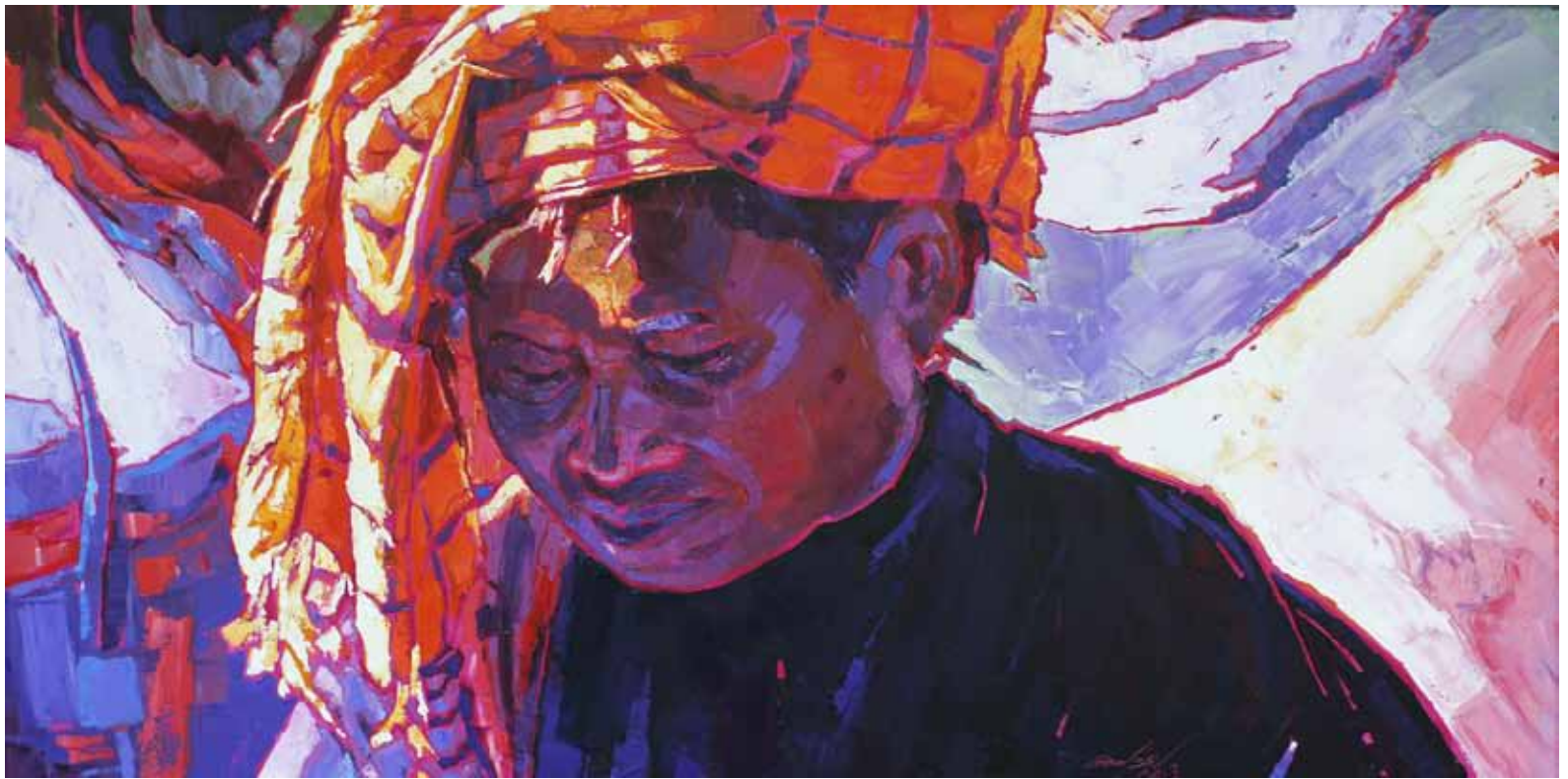
Market Day, 2013 | Oil on canvas | 153 x 76 cm